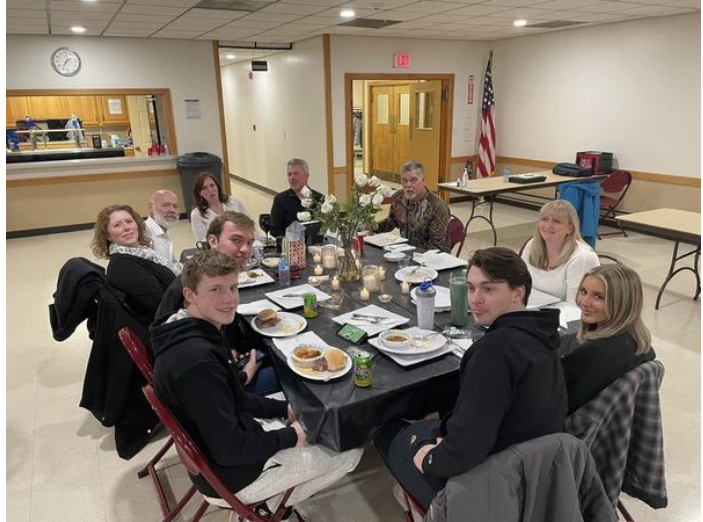
Above and Below Annual Game Dinner January 6th