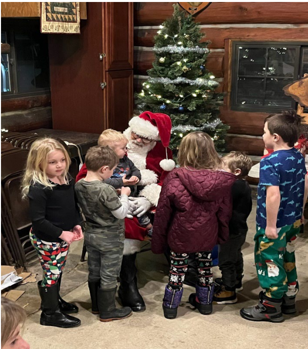
Above -Annual Christmas Party December 16th